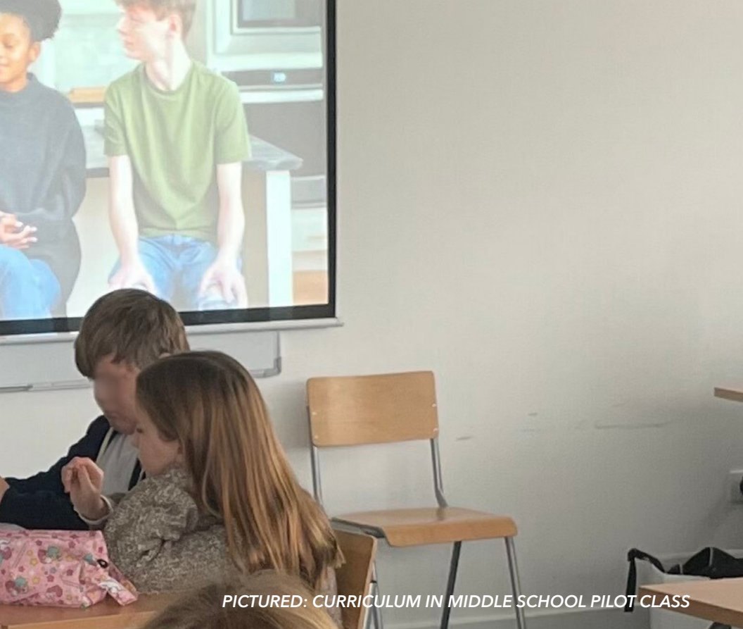
PICTURED: CURRICULUM IN MIDDLE SCHOOL PILOT CLASS

AFTER RECEIVING MODULE 1 ON HEALTHY RELATIONSHIPS, 25% OF ONE CLASS REPORTED INAPPROPRIATE PERSONAL BOUNDARIES BEING CROSSED WITH NON-CONSENSUAL PHYSICAL INTERACTIONS AND SEXUAL REFERENCES WITH THEIR PEERS, ALLOWING FOR IMMEDIATE HELP FROM TRUSTED ADULTS.