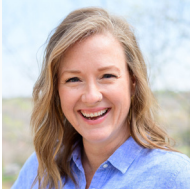
JOY COVER PRESIDENT